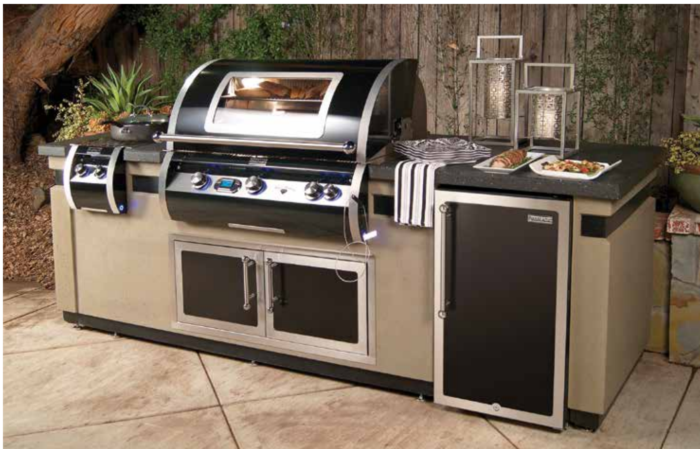
Grills – both simple and elaborate – are a center point of outdoor kitchens, bringing the reliability and efficiency of natural gas to help create the perfect backyard oasis.

grills, pizza ovens and firepits. They may want to add a heating element to maximize its functionality. A homeowner can probably develop a great plan for any budget.”