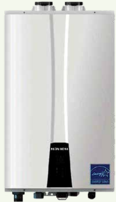
Because tankless systems deliver hot water only when needed, they save both energy and money.

Tankless systems certified by the Environmental Protection Agency's ENERGY STAR® program are often eligible for utility rebates to help offset the initial purchase price. ■