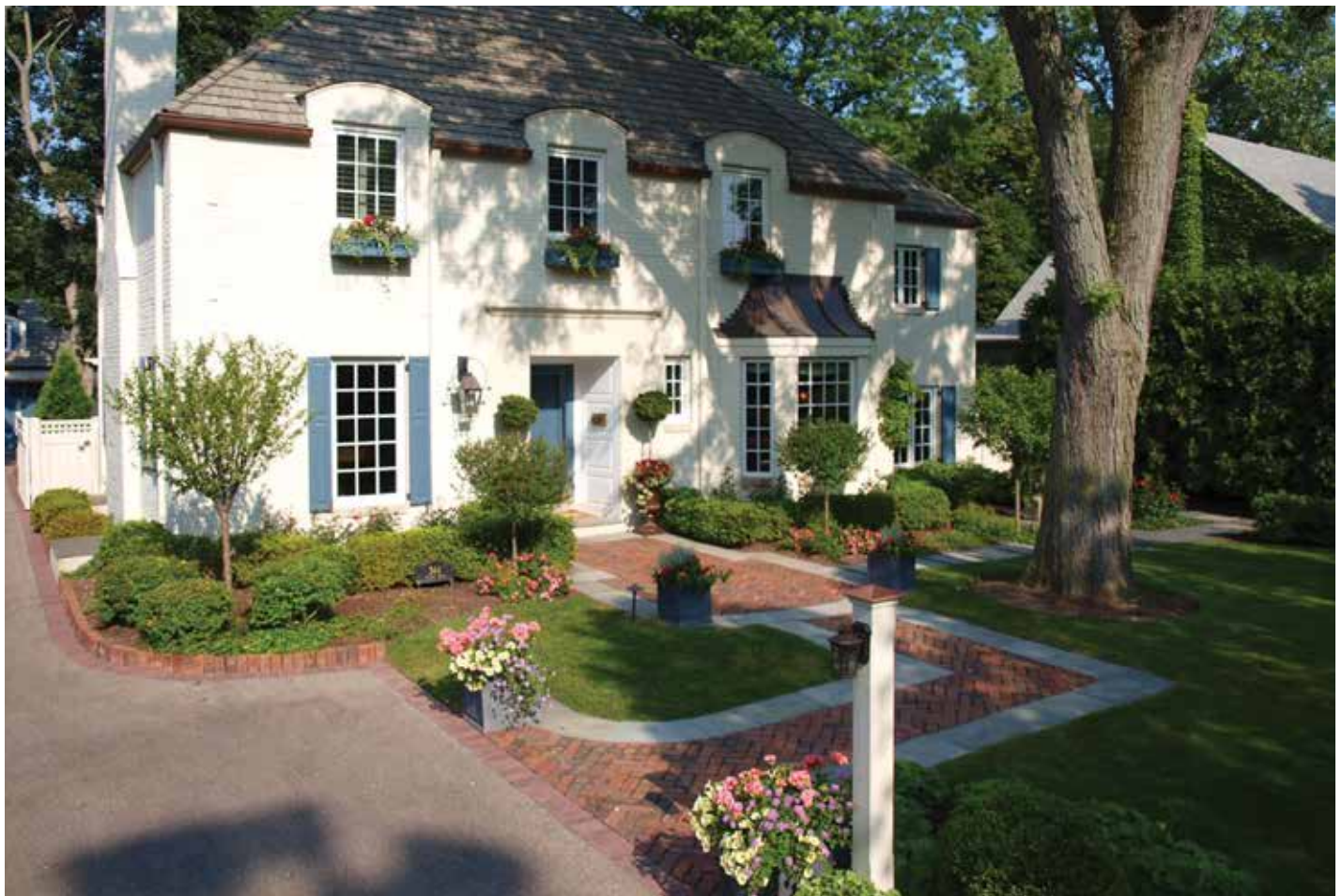
Getting your home and yard ready for spring requires some basic landscaping and a few general maintenance tasks.