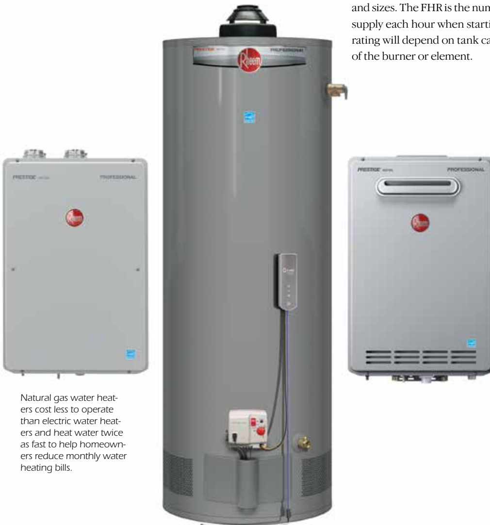
Natural gas water heaters cost less to operate than electric water heaters and heat water twice as fast to help homeowners reduce monthly water heating bills.